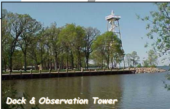
Dock & Observation Tower