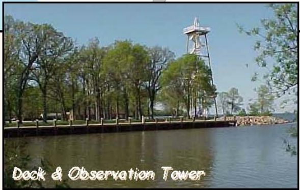
Deck & Observation Tower